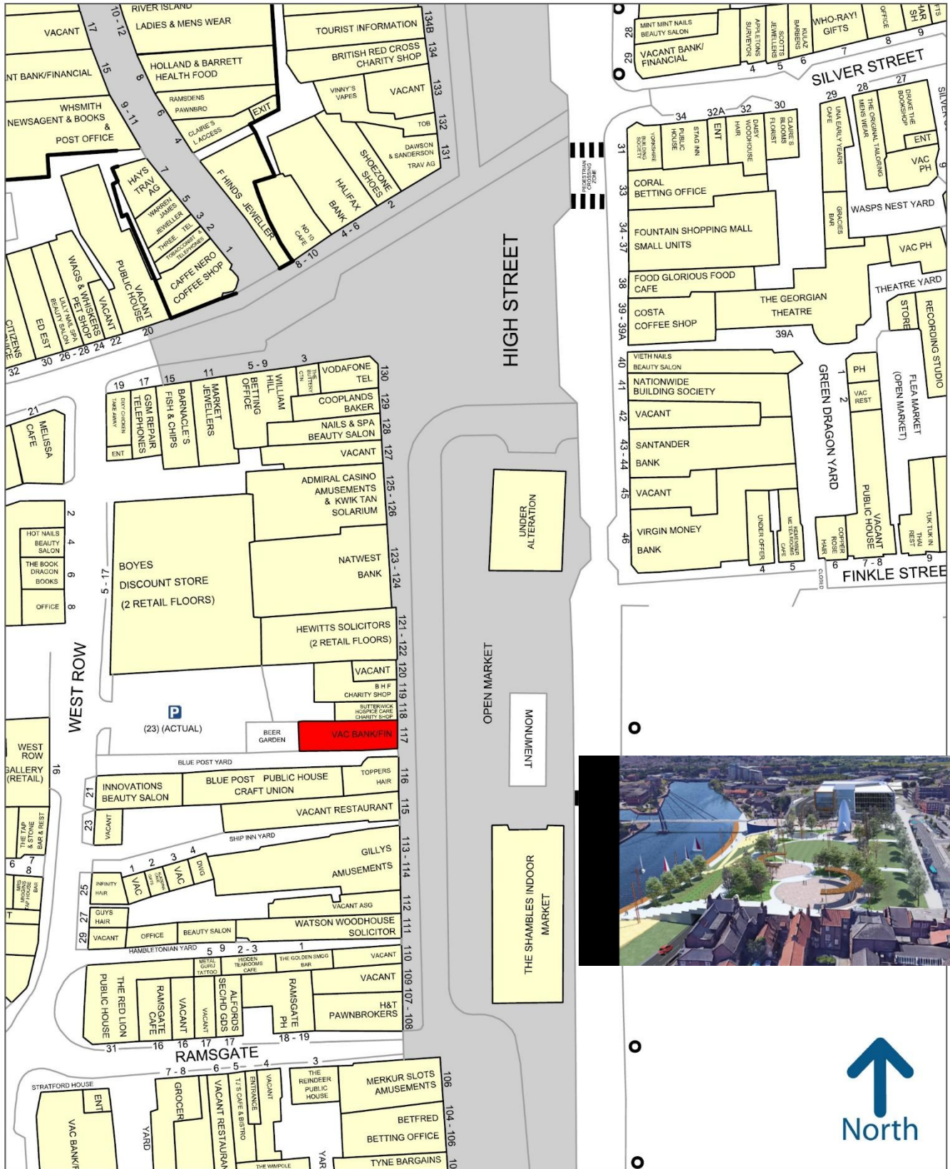
50 metres Copyright and confidentiality Experian, 2023. © Crown

Experian Goad Plan Created: 17/07/2024 Created By: Connect Property North East Ltd