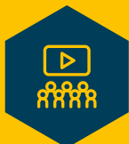
Meetings & Events